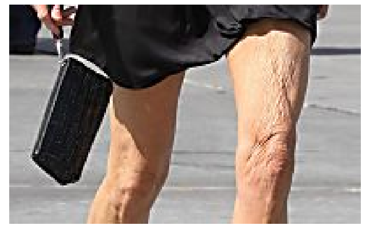
HEALTH HEADLINES >

Stop Eating These 'Digestive Destroyers'