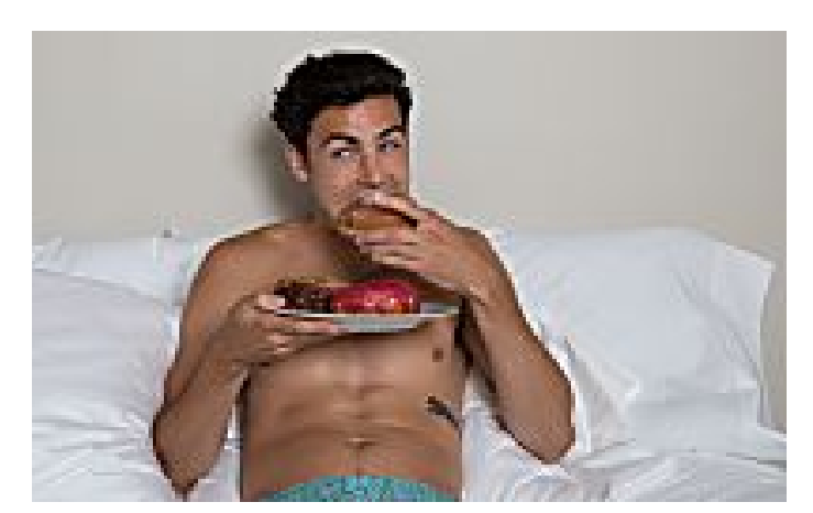
BUSINESS INSIDER >