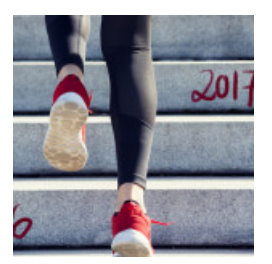
SPONSORED CONTENT How to Train for Your Best Blue Cross Broad Street Run